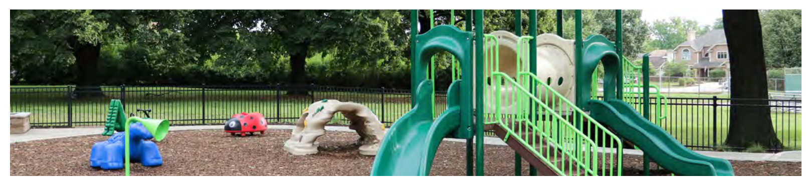
FALL 2023 ACTIVITY GUIDE

Extend your child's day by enrolling in our Extended Day, Lunch Bunch or Afternoon Adventures programs. Age limits apply. Contact Christina for complete information at christina@butterfieldpd.com for by calling 630-858-2229 x14.